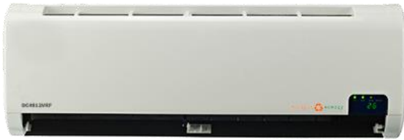
Wall Mount Indoor Unit (IDU)

12,000 BTU 48V DC Heat Pump VRF Dynamic Capacity Compressor 100% DC - No Inverter